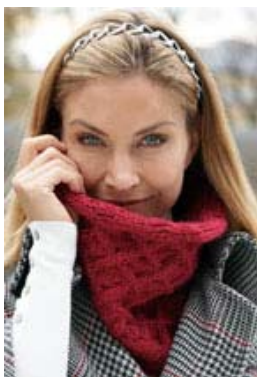
Lattice Cowl (knit)