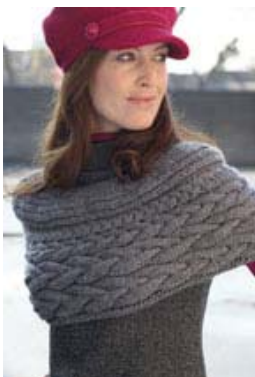
Shoulder Shrug (knit)