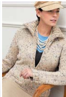
Zip Front Cardigan with Flared Sleeves (knit)