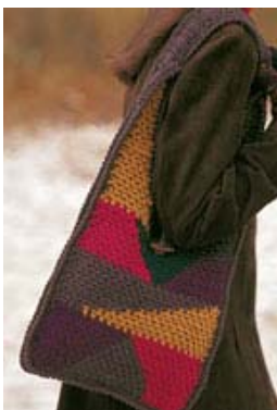
Patchwork Purse (crochet)