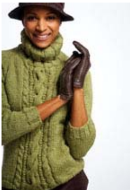
Dolly's Sweater (knit)