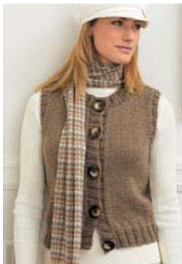
Button Front Crew Neck Vest (knit)