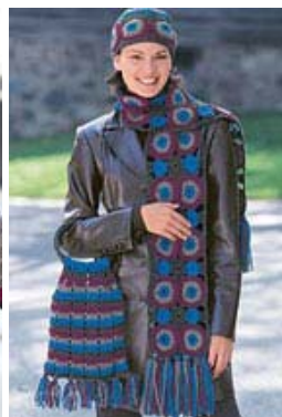
On the Wild Side Set (crochet)