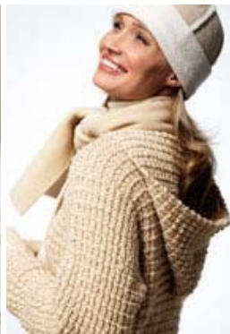
April's Pullover (knit)