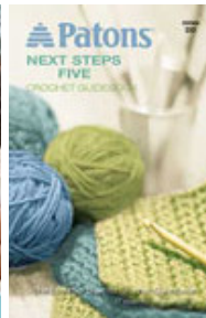
Next Steps Five: Crochet Guidebook