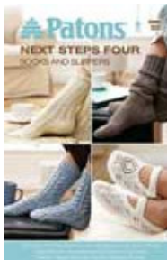
Next Steps Four: Socks and Slippers