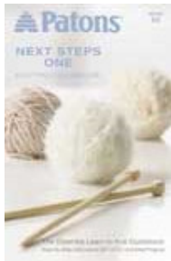
Next Steps One: Knitting Guidebook

Our series of 'Next Steps' books have been refreshing knitting and crocheting memories as well as teaching new skills from scratch for 5 years. Don't forget about the other great books in the Next Steps series!