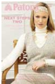
Next Steps Two: Create Your Own Pullover