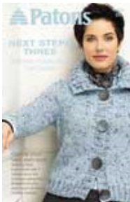
Next Steps Three: Create Your Own Cardigan